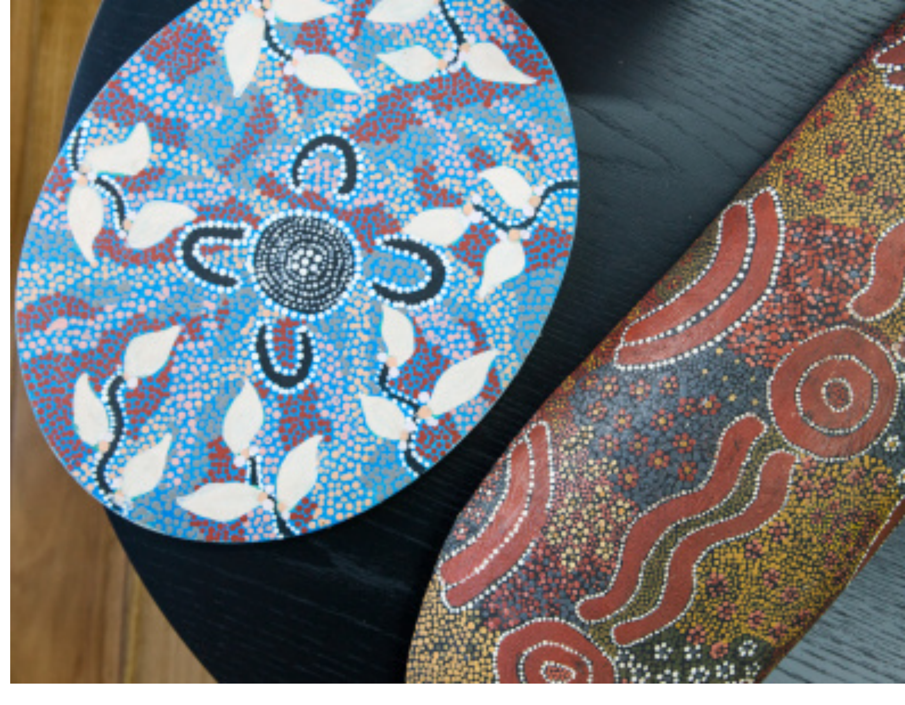
The Indigenous Furniture Company Making a Statement ART & DESIGN