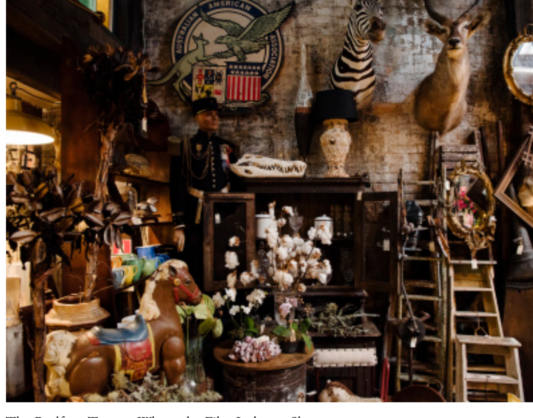
The Redfern Terrace Where the Film Industry Shops ART & DESIGN