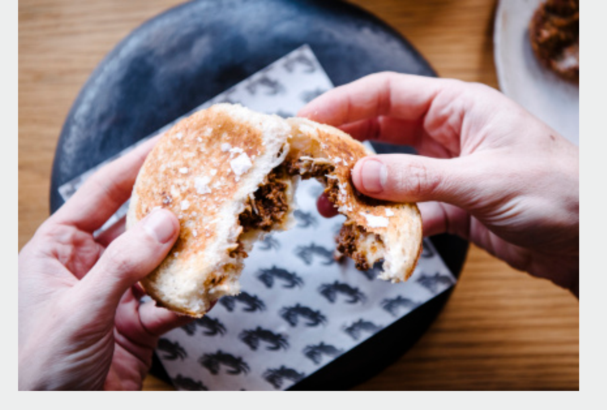
Biota Dining Chippendale RESTAURANT