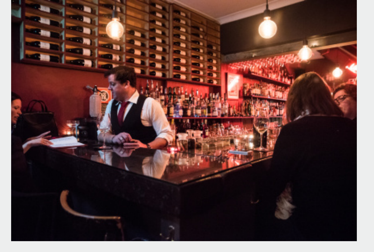
The Owl House BAR